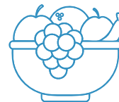
Bread & Produce Basket