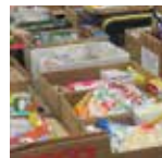
Nutritionally-based Food Hampers