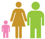
Client Connections to other agencies & programs

Your investment supports families and individuals in need of food assistance and other programs and services: